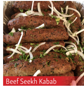
Beef Seekh Kabab